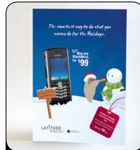
Latitude Wireless branding campaigns