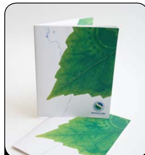
Mackenzie Valley Review Board Annual Reports