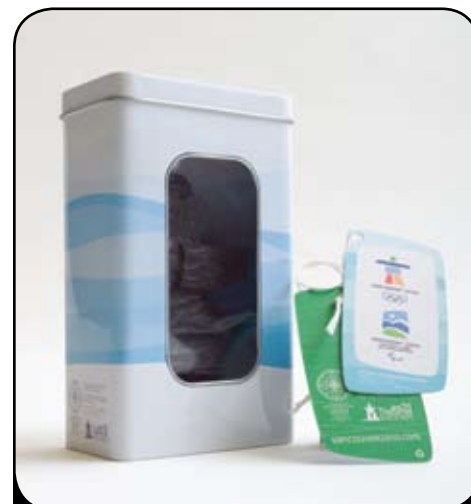
Nunavut Development Corporation Inuksuit Project